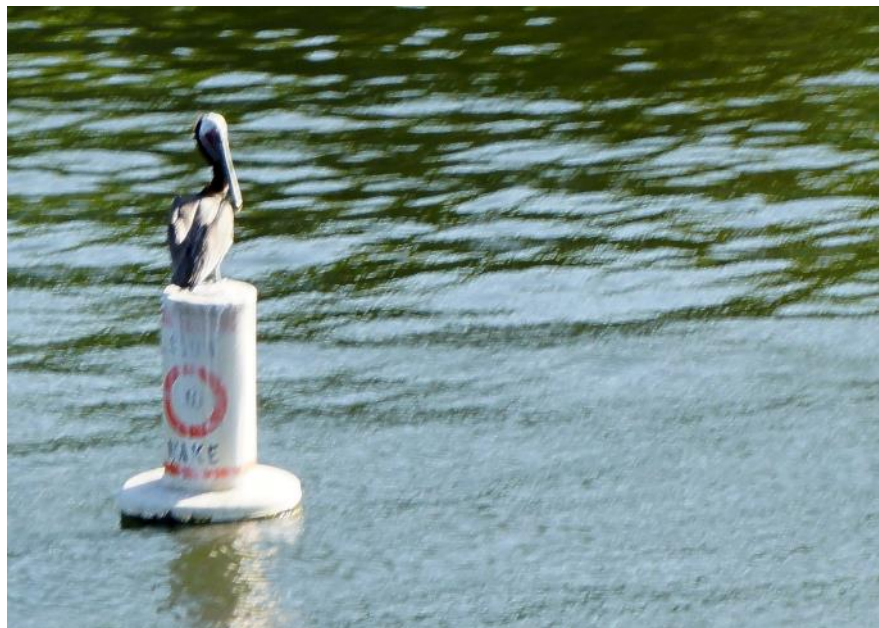
To the Left: A very confused pelican, far, far from home. It would not survive an Arizona summer, so the plan was to capture and relocate it back to California.