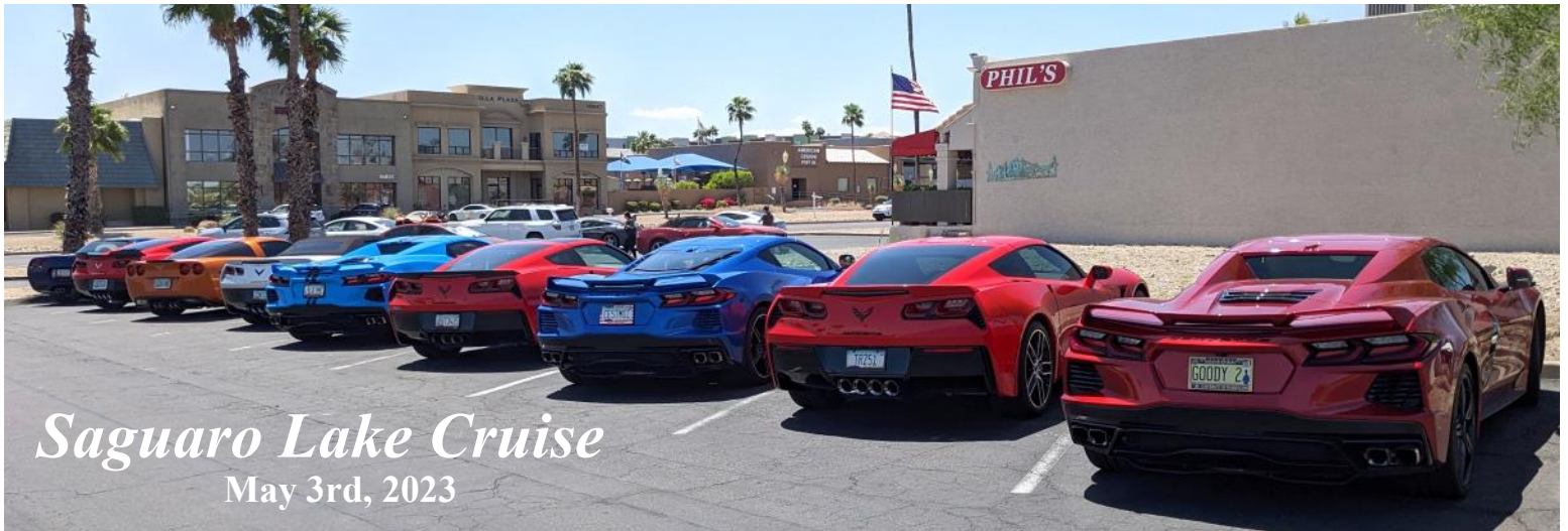
Saguaro Lake Cruise May 3rd, 2023