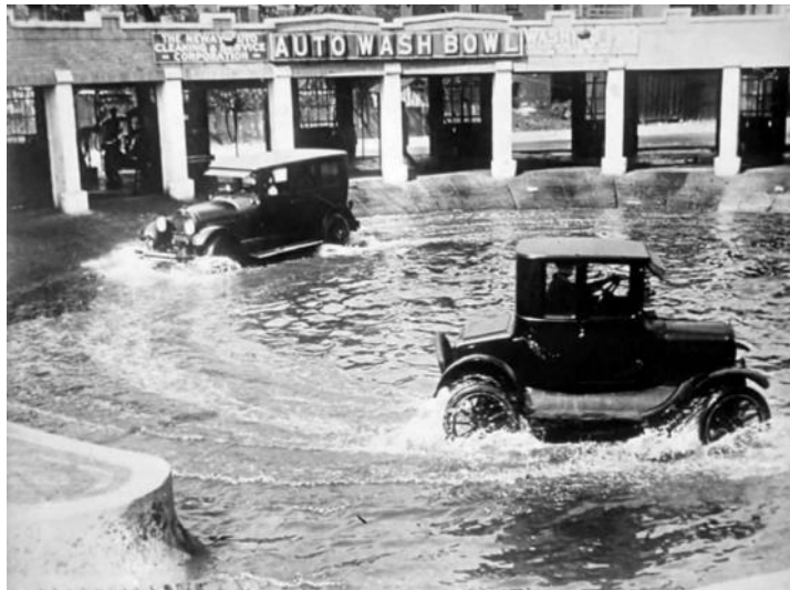
After you drove around in a circle, they hosed off the top side.