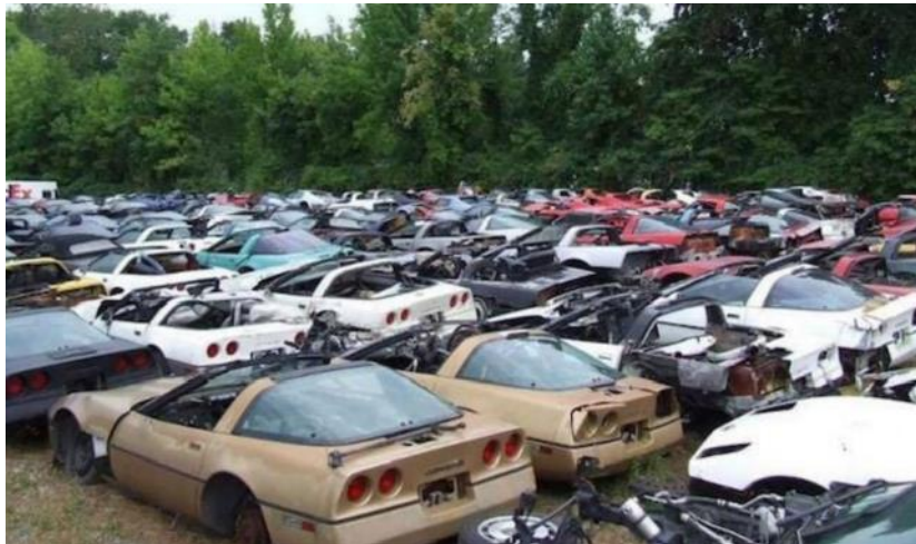
Where C4's go to die.