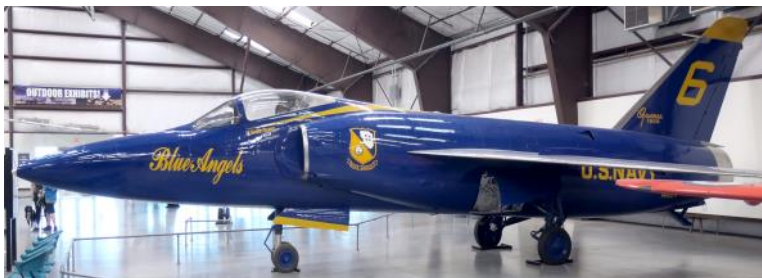
"Mr. Cruise, your ride is here."