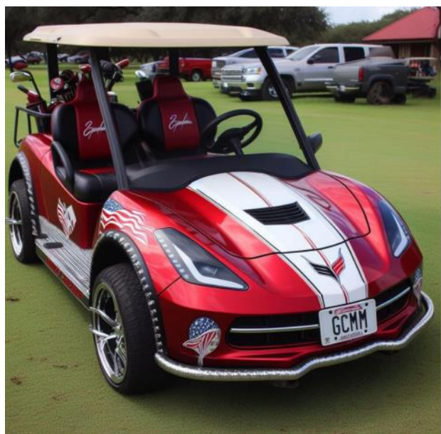
Right: So, where's the kid?