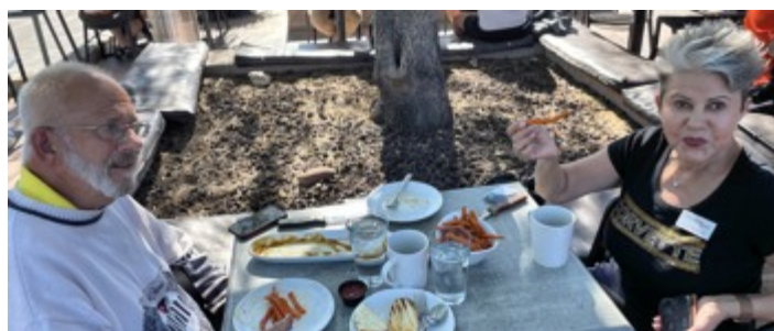
Peter and Lucy

After a winding entrance road, you finally see it - this glimmering, beautiful, absolutely enormous group of buildings. It's not just the sealed 3.1-acre greenhouse complex, it is a complete compound with housing for students and scientists, meeting rooms, support and maintenance buildings, even a gift shop! While the initial experiment may have failed, this is indeed a thriving ongoing experiment that has taken off in many directions over the years and is anything but a failure!!