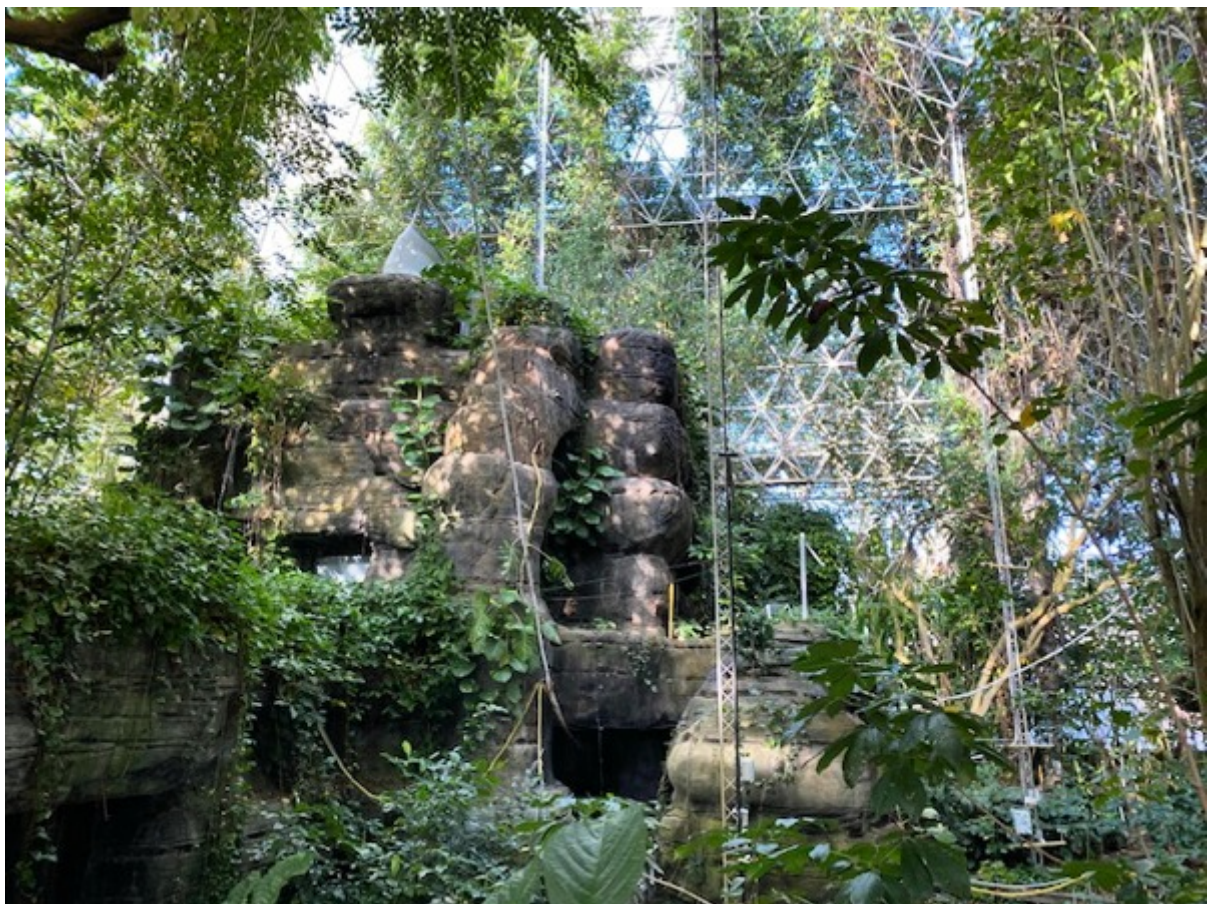
Inside the Biosphere 2