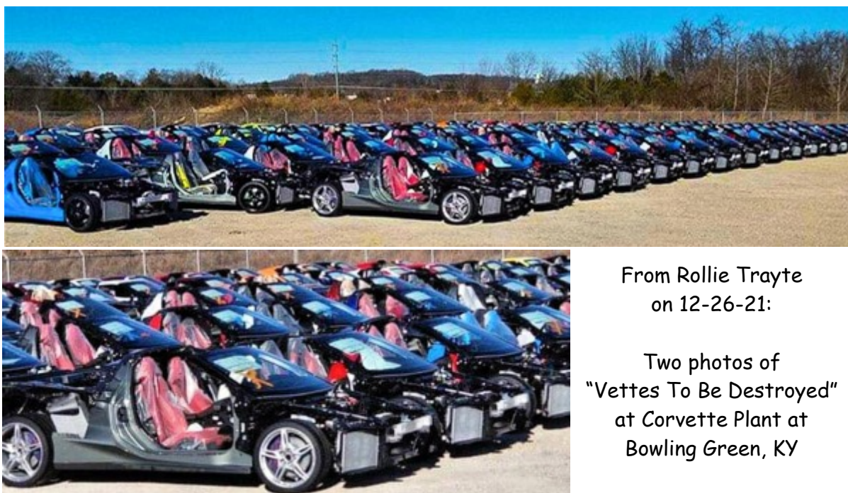
From Rollie Trayte on 12-26-21:

While those who had mid-engined Corvettes on order might not like waiting extra weeks or months to get their cars, the damage left by the storm should if anything make them grateful they escaped inconvenienced, but unscathed. Cars, after all, can be replaced, while every life lost to the tornadoes was one-of-a-kind.