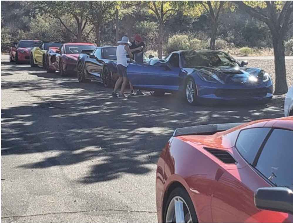
Vettes at Biosphere 2

We signed up for "The Biosphere 2 Experience" which is a self-guided walking tour to and through the grounds and greenhouse.