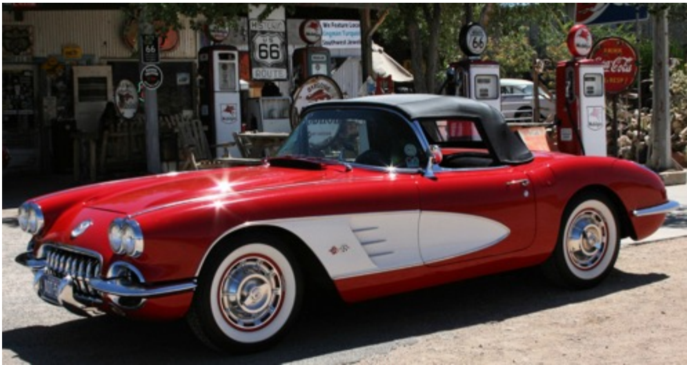
The 1960 at Hackberry Store on Route 66