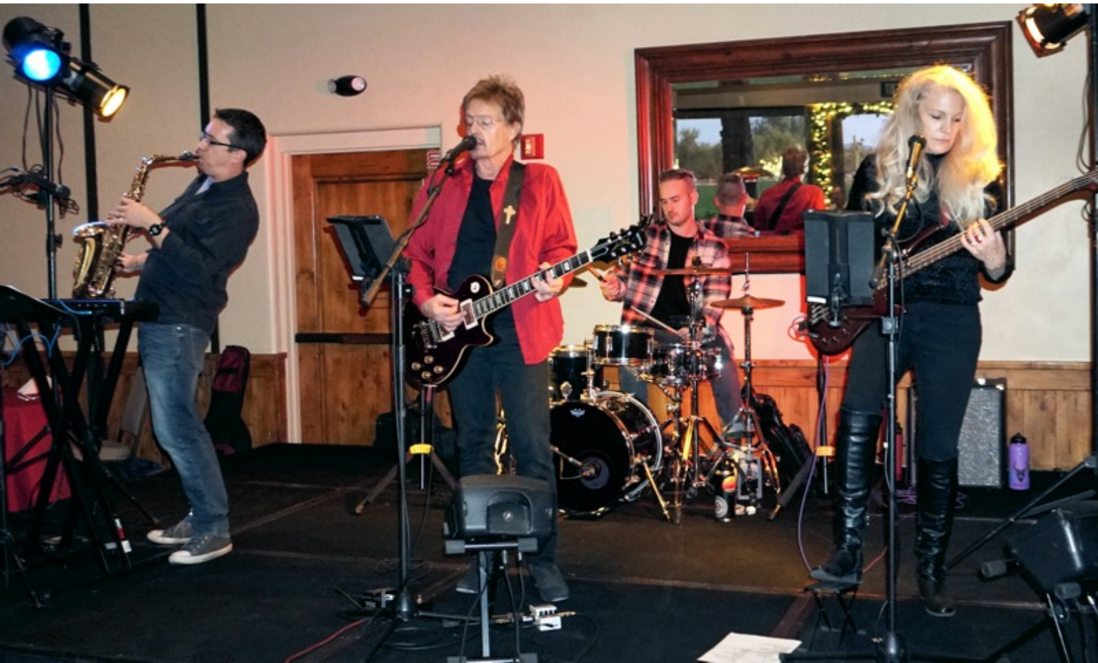
Mercer Lane Band