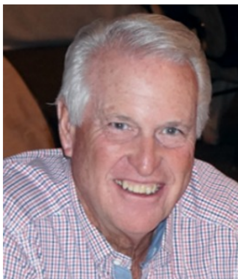
Ed Luse, Governor