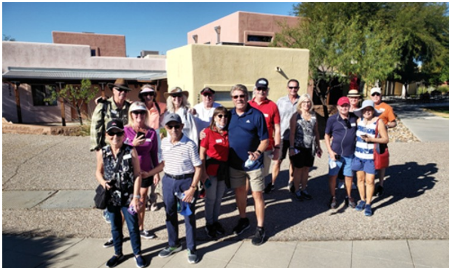
SCC Group at Biosphere 2