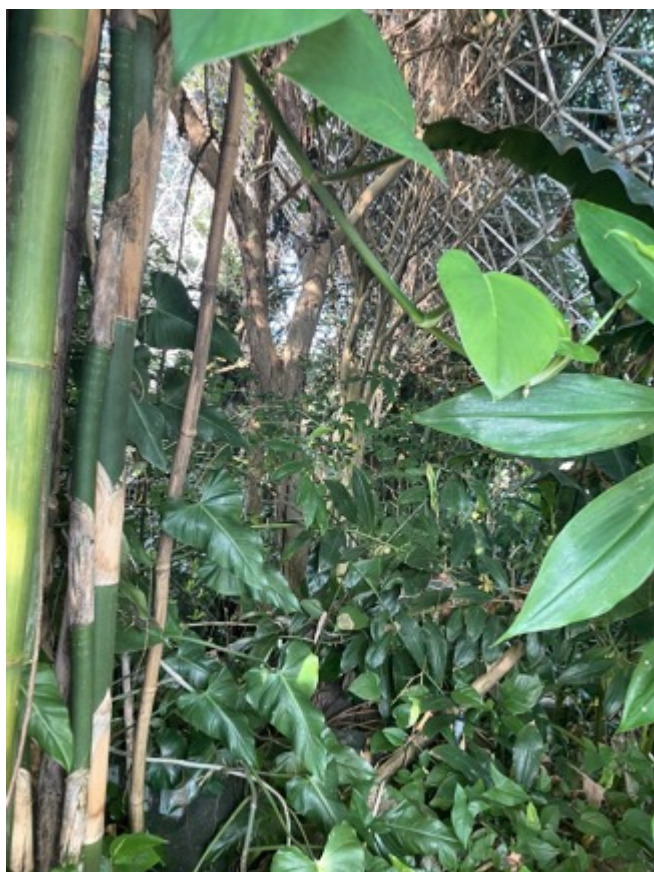
The Rainforest at Biosphere 2