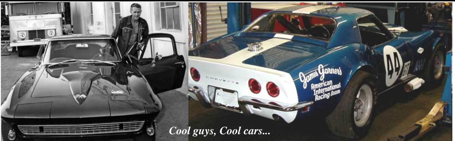
Cool guys, Cool cars...