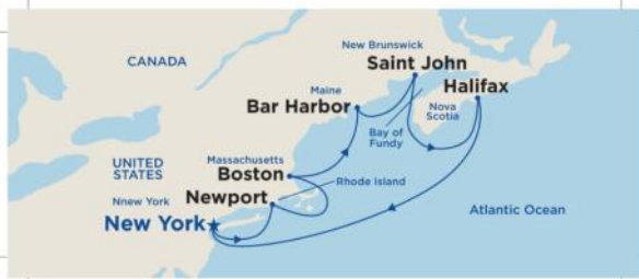
NNR070_7 Day Canada & New England_R6_MB_CD

To Book, contact Suzy Poulter Suzy@SuzyCruisy.com or call/text 925-200-8166