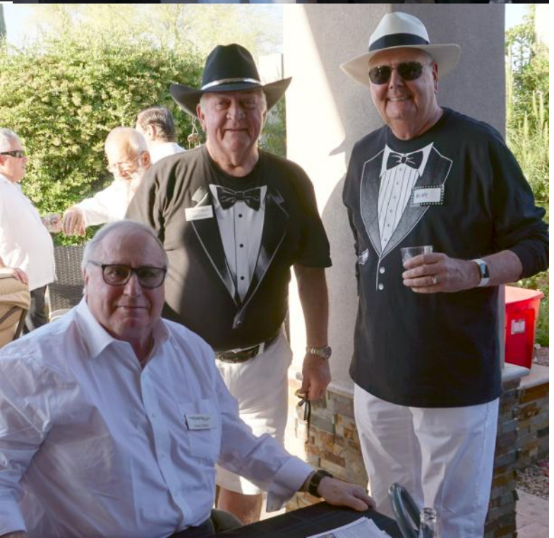
The Cowboy Mafia...