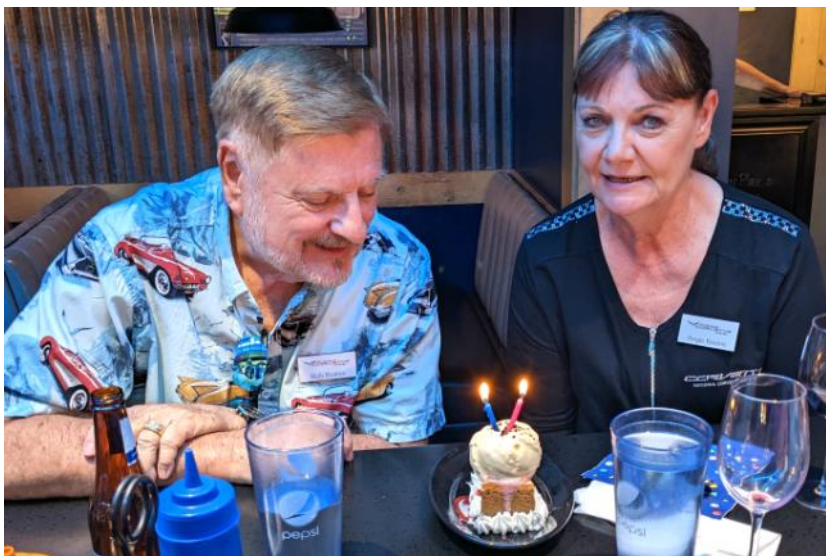
Last, but not least...