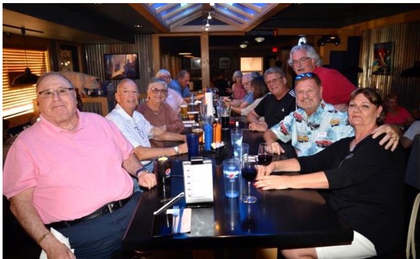
Last Supper - Blu Pig