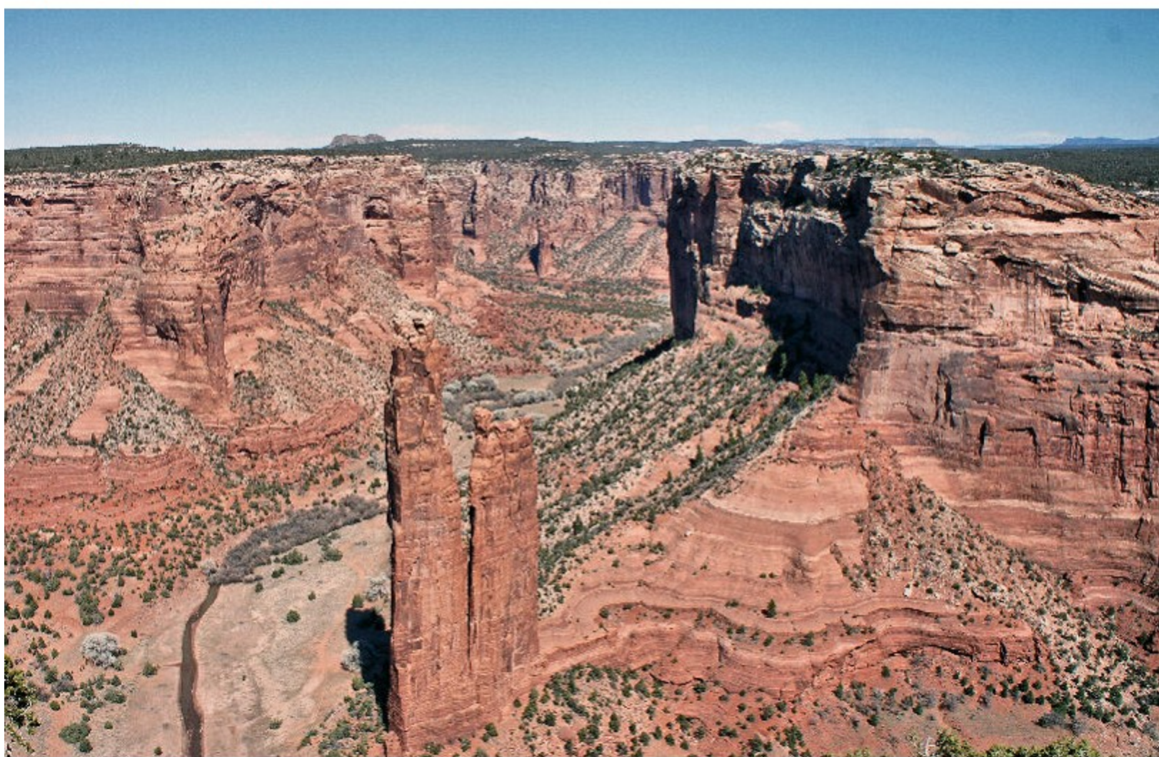
Spider Rock - the End of the Tour