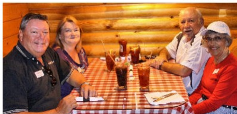
Lunch at Kohl's Ranch