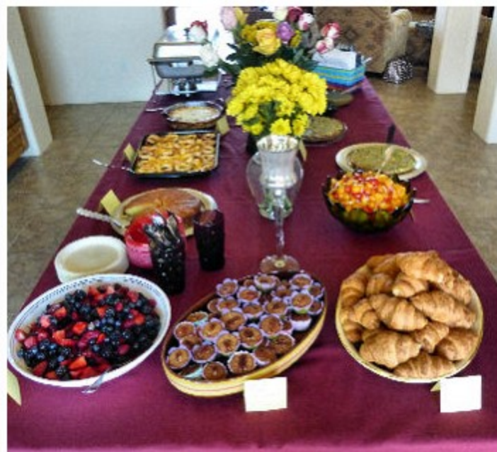
The Buffet Table

The members were treated to a gourmet menu that could rival any 5-star restaurant. An array of quiches, meats, fruits, salads and sweets satisfied everyone's palate. The brunch ended with individual members returning home at their leisure.