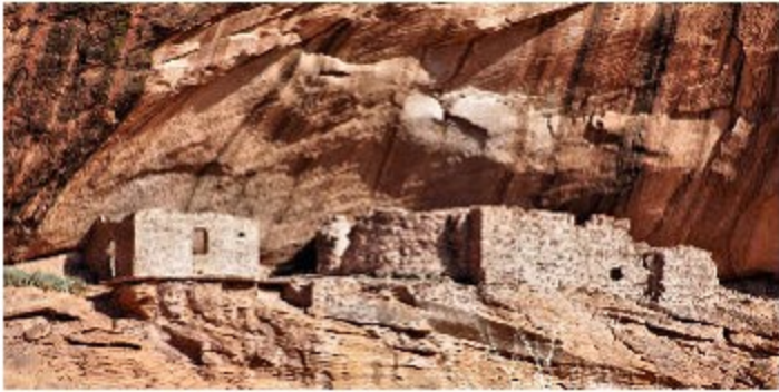
Views of the ruins, including the White House, below left