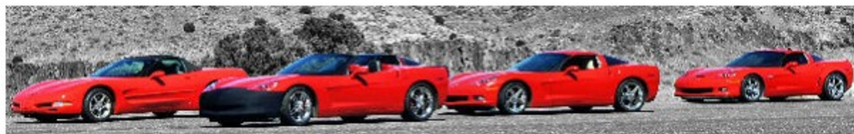
All Corvettes Are Red! PART II