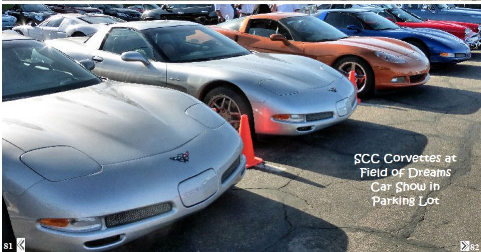
SCC Corvettes at Field of Dreams Car Show in Parking Lot