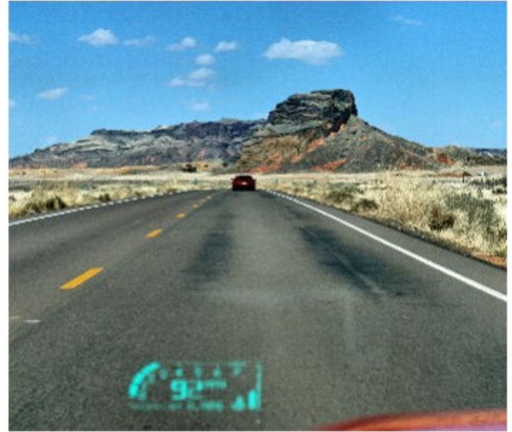
The straight and barren road to Chinle

After driving several miles on Route 191, a straight and barren road with nothing but wind and dust and some sagebrush, we arrived to the Best Western Canyon de Chelly Inn, in Chinle Arizona. The hotel was a pleasant surprise - clean and newly remodeled, located only three miles from Canyon de Chelly.