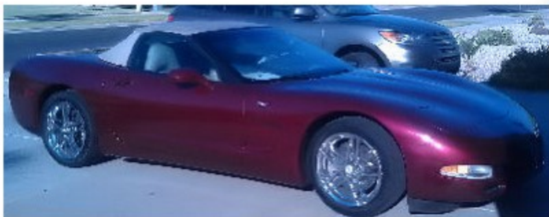
Jim and Cis Eberst's 2003 Anniversary Red Roadster! Click on the photo to see a larger view.