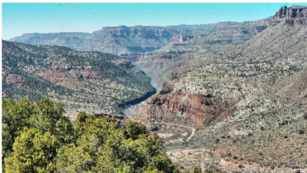
Salt River Canyon