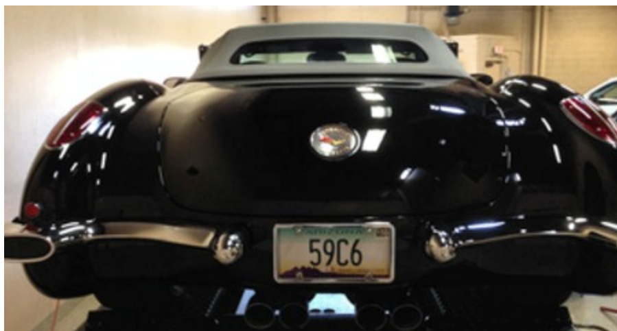
Jim Voice's 2008 Corvette C6 with a 1959 body