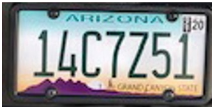
Jerry and Pam Strimbu

Jerry says: 'I've attached a picture of our C7 license tag for potential inclusion in the upcoming article about them. The choice for the tag was driven by the fact that when we got the car there were very few C7's on the road (Our car was the first C7 to be delivered to a Club member). The idea was to help identify the car as a 2014 C7 Z-51 since most drivers did not know what kind of car it was. We have a C8 on order, and we'll probably go for 20C8Z51 for that one when it arrives; it was supposed to be built the week of March 16 but is now on the line awaiting assembly in Bowling Green."