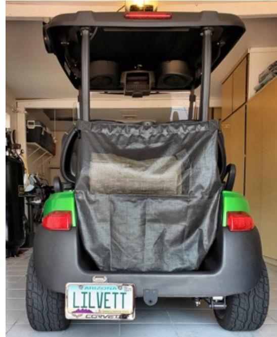
"LILVETT" is on my '19 Club Car Golf Cart

The "NOKONES" plate is on my '13 Grand Sport Manual Tranny Coupe. I occasionally autocross my Grand Sport thus, the "No Cones" plate like my '89 C4 Autocross car except that the last letter is the "S" whereas, the last letter on my '89 Autocross Car is a "Z" in order to have two plates that read "no-cones." The "K" was used for both plates just to be different and original. I had both of these plates in California.