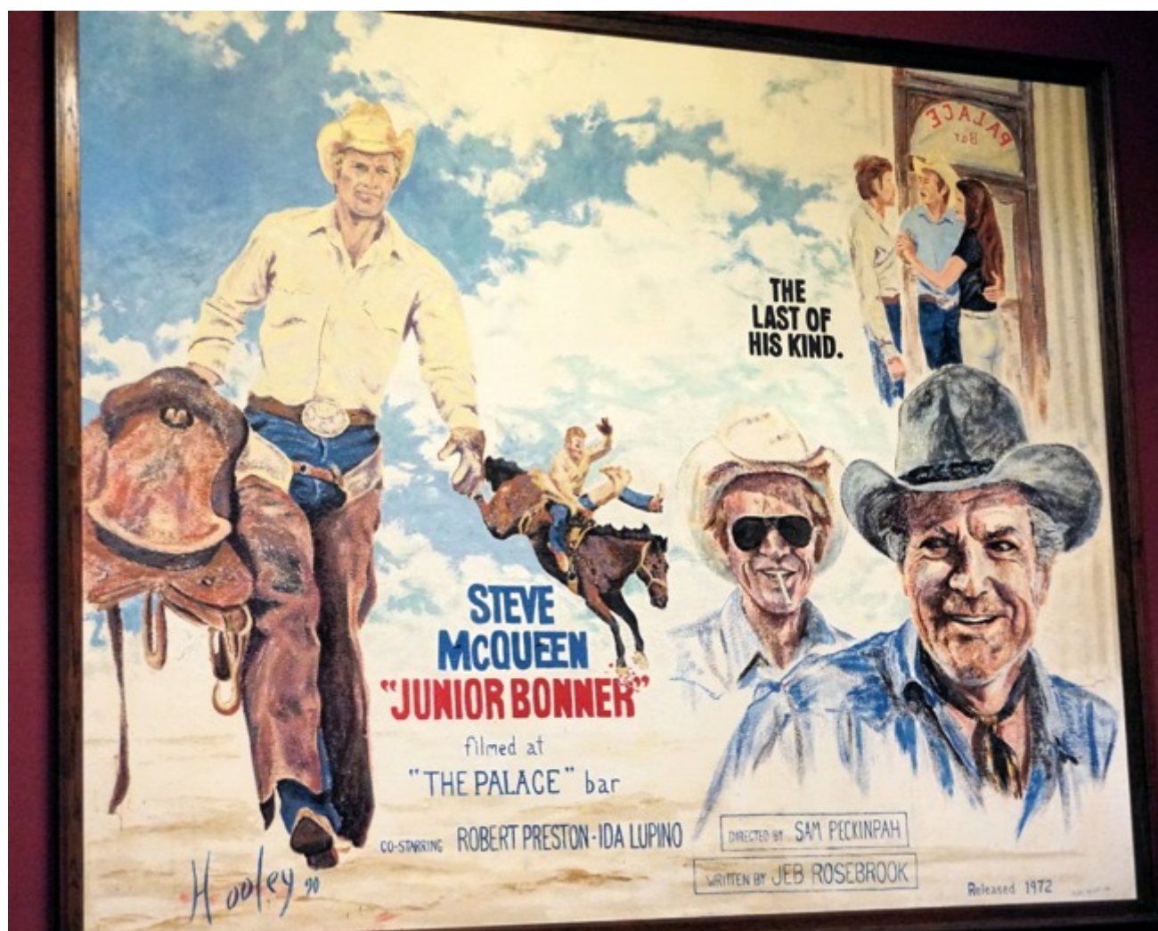
Old Mural at the Palace Saloon