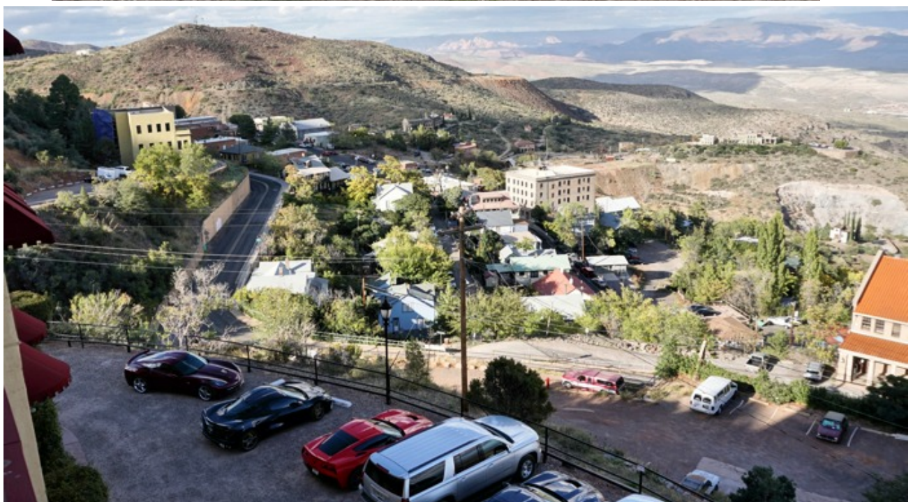
View from hotel balcony