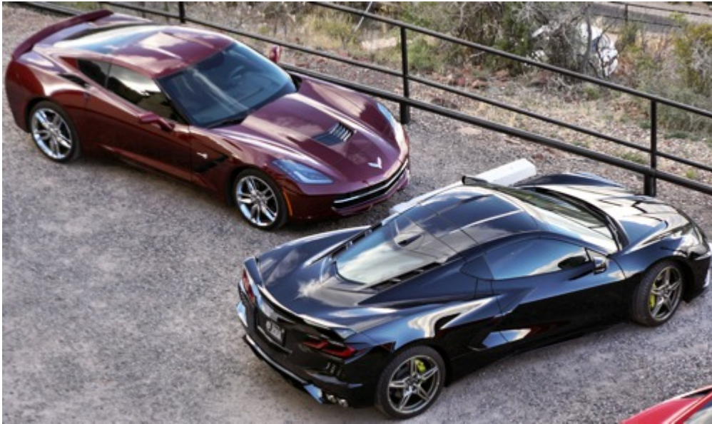
Corvettes in Hotel Parking Lot