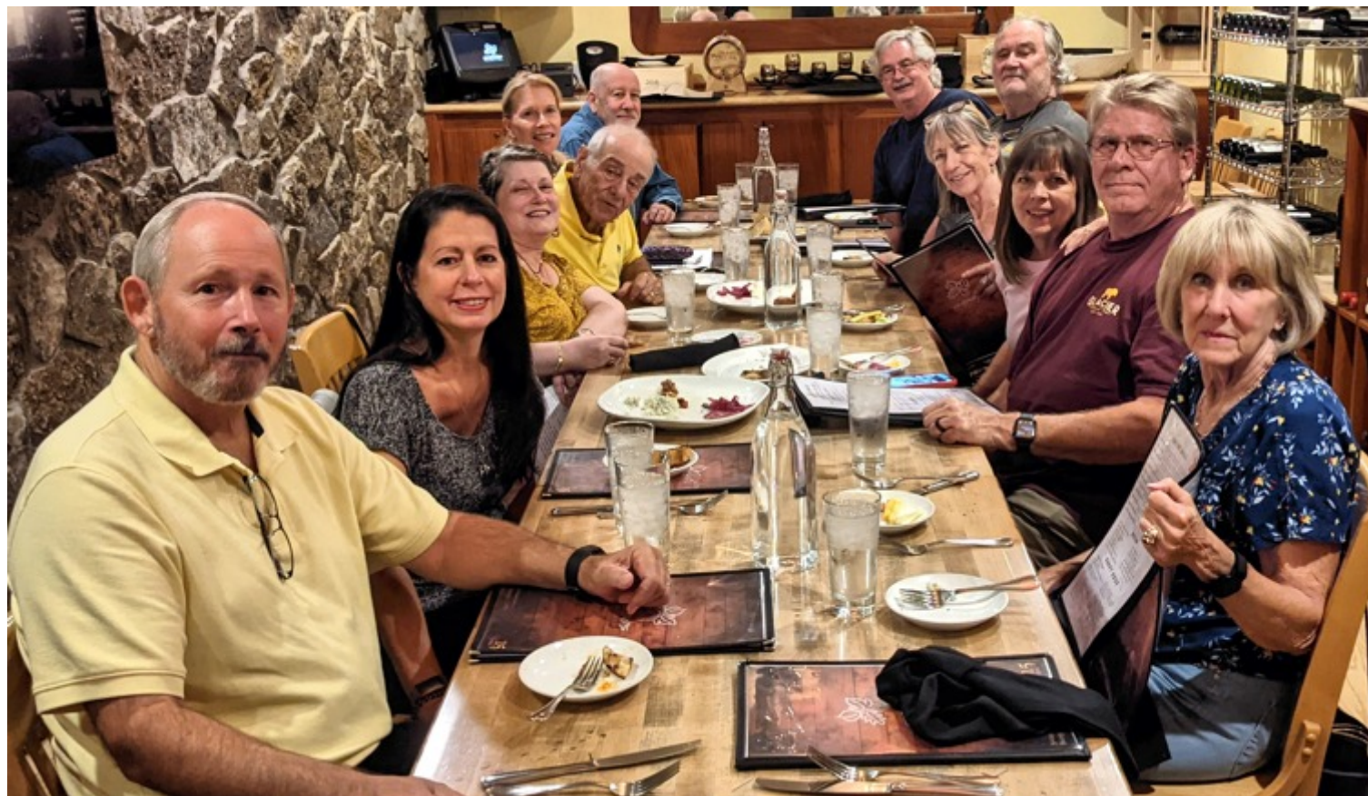
Dinner at Seasons