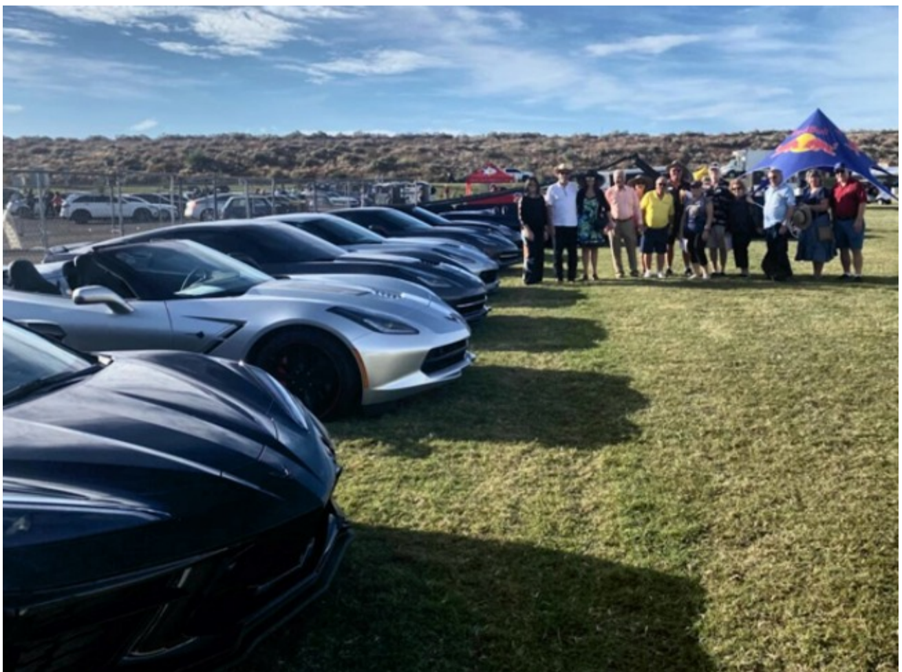
The SCC Group and their Corvettes