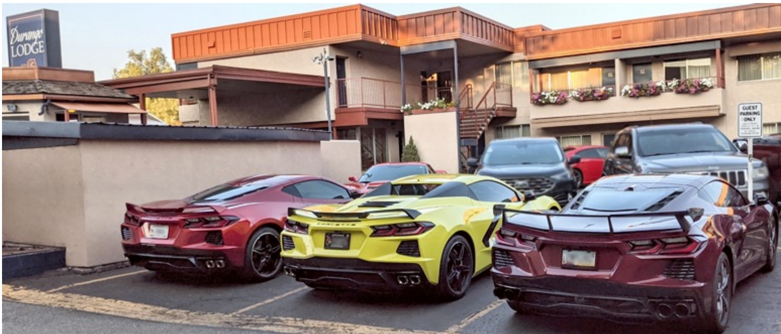
Corvettes at Durango Lodge