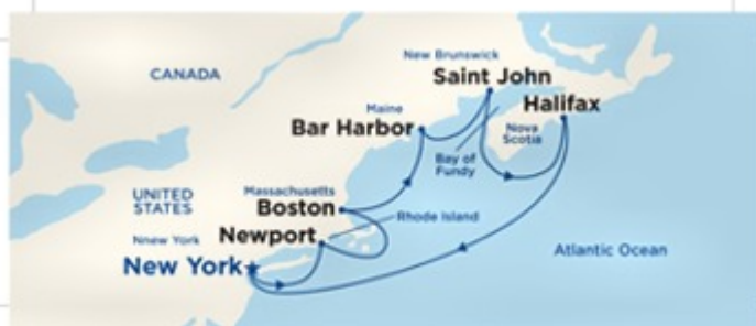
NNR070_7 Day Canada & New England_R6_MB_CD